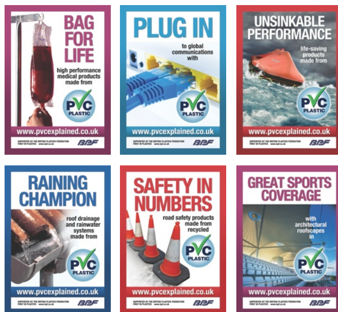
Six of the twelve posters available

Downloads of the posters, designed as part of the BPF's 'Modern Life with PVC Plastics' campaign can be requested here